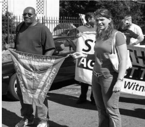
The Peace Center banner, Coordinator, and Interns show up all over town: (top) 10/2/04 Peace March; (bottom) 9/18/04 Green Festival.

The Peace Center bustled with activity in preparation for the 40th Anniversary Celebration, held on November 13, 2004, at our original home, the Friends Meeting House on Florida Avenue NW. We at the Peace Center view the anniversary as a time for us to reflect on the many years of service and to plan for our organization's future. We were delighted to greet several dozen friends. (More information p. 18.)