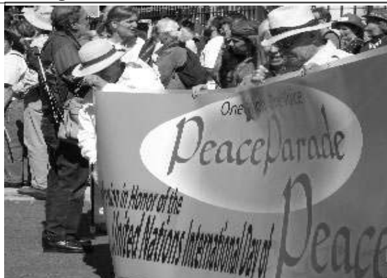
On October 2nd, 500 people held a memorial procession from Arlington National Cemetery to the White House to call for an end to the illegal U.S. occupation of Iraq. (Story on page 18.)