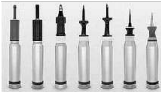
Depleted uranium "penetrators" are equipped with super-hard piercing points which punch through steel, and combustible ceramic coatings which burst into flames on contact. Tiny radioactive particles drift downwind.